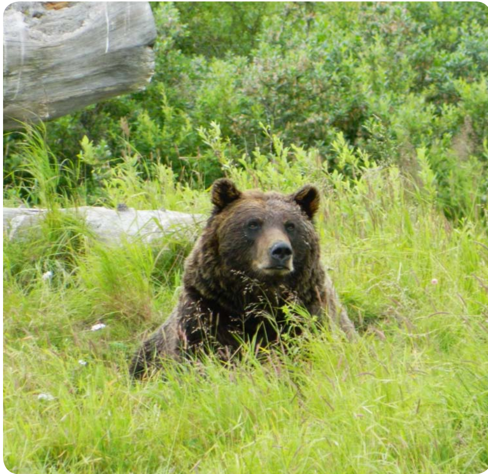
A bear at the Alaska Wildlife Conservation Center in Portage

This publication lists organizations serving rural Alaskans. No organization has been intentionally excluded from this directory. If you would like your organization listed in future directories please mail or email your contact information to: